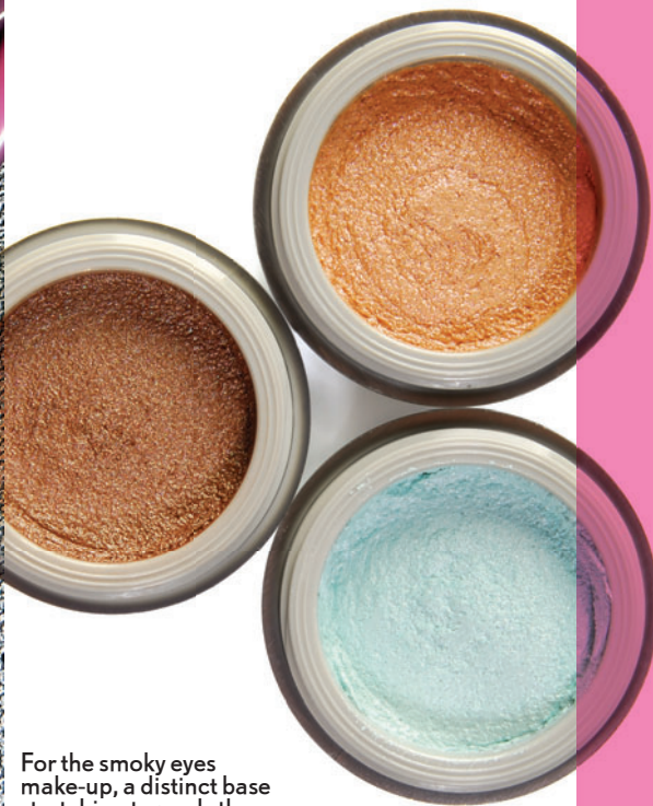
For the smoky eyes make-up, a distinct base stretching towards the eyebrows is prepared with brightly colored pastel eye shadows.

priests specialized in preparing the eye shadows and balms and adopted them as privileges, both aesthetically and symbolically. Therefore, it's apparent that make-up was not reserved solely to women in those days.