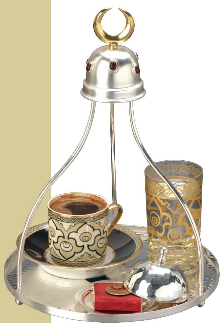
Hiref's latest collection, presented in December 2009 consists of 36 pieces. The design team have worked with filigree and created a collection ornated with onyx.